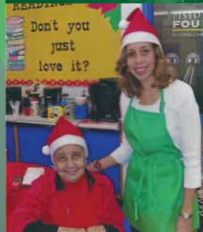
FESTIVAL OF GIVING