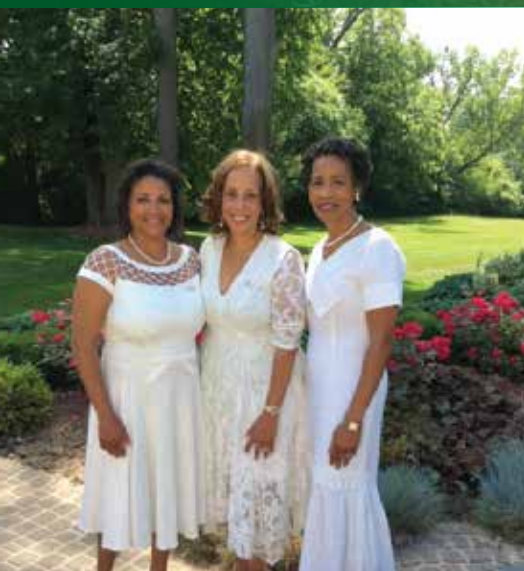
CHAPTER LINKS AT INDUCTION