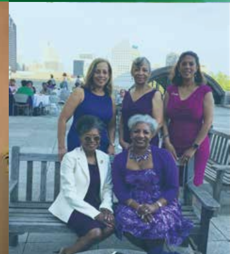
LINKS IN MINNEAPOLIS