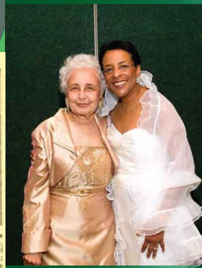
LINK ROSE IS PLATINUM