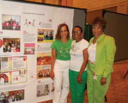
HHS PRESENTATION IN ORLANDO