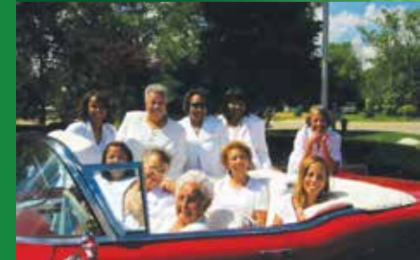
CRUISING IN THE MOTOR CITY