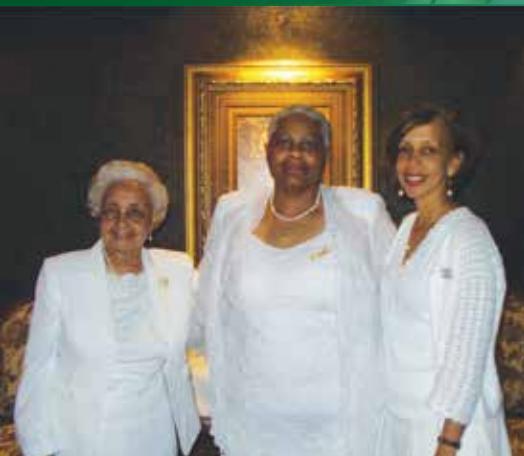
INDUCTION IN YOUNGSTOWN