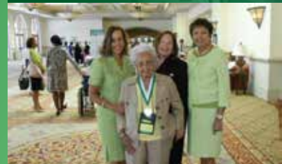
FAMILY OF LINKS ORLANDO NATIONAL ASSEMBLY